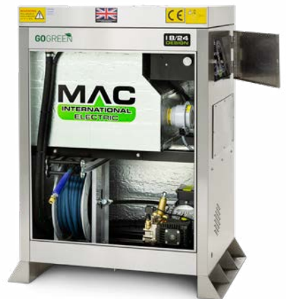
OPTIONAL INTERNAL HOSE REEL AVAILABLE