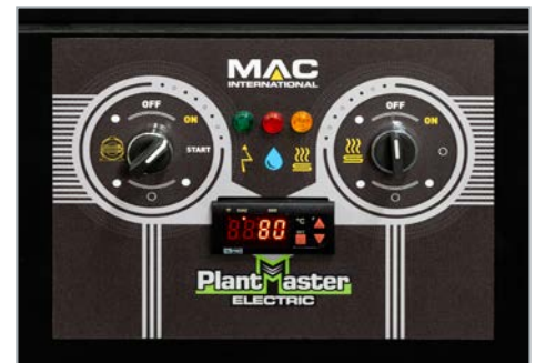
USER FRIENDLY CONTROLS